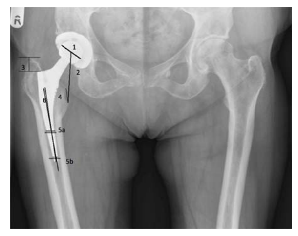
Fig. 2. Subsidence measurement. (1) Centre of head for magnification error (ME), (2) centre of head to tip of lesser trochanter (LT), (3) tip of greater trochanter to shoulder of stem (GT), (4) calcar height (CH), (5) canal fill ratio, (5a) middle 1/3, (5b) lower 1/3, (6) varus or valgus angulation.

In both groups, there were comparable distribution of gender; age, BMI, prosthetic size, and prosthetic metaphyseal and diaphyseal fill ratios (Table 1). Combining the two groups, 9% hip replacements (11/121) showed radiographic evidence of subsidence at 1-year follow up. Majority of the subsidence was found to have occurred within the first 6–8 weeks in both groups. 7.6% (5/66) implants in the collared group and 10.9% (6/55) implants in the collarless group showed subsidence within the 6–8 weeks. After this stage, 2 patients had further subsidence of implants and underwent revision at 13 months for the collared stem and 36 months for the collarless stem after primary surgery. No further subsidence was seen in the remaining subsided implants in both groups (Tables 1 and 5).