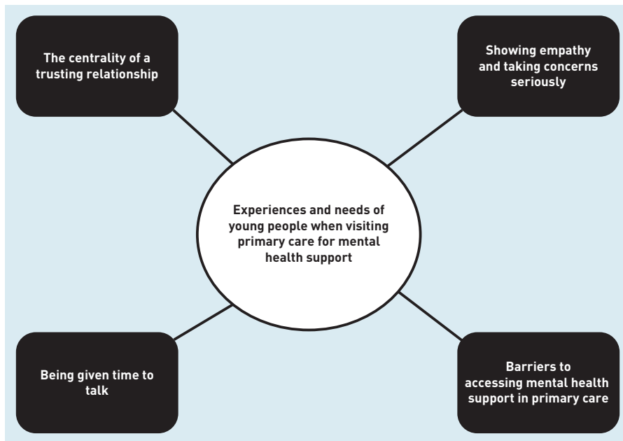
Figure 2. Overview of themes.

'I don't think doctors know as much about [mental health]. Because they have no experience ...' 20