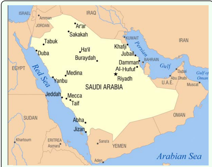
Figure 1. Map of Saudi Arabia showing Al-Hufu, the capital of Al-Ahsaa district. High quality figures are available online.