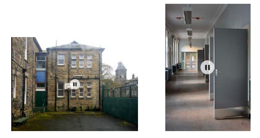
Figs i and ii An exterior wing of High Royds and an interior corridor.