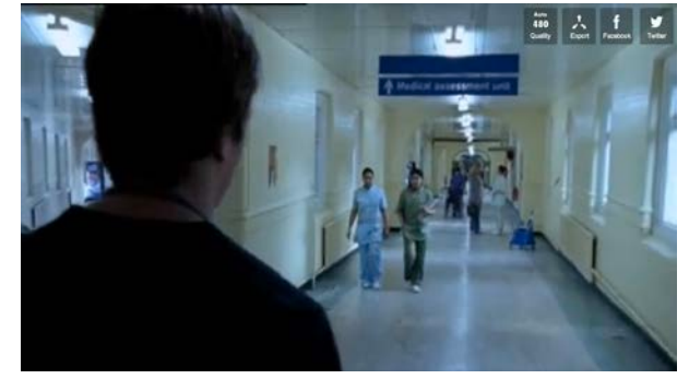
Figs iii and iv The location as it appears in the series

The semiotics of this space thus immediately embeds the drama in an NHS-with-a-history, distinguishing it both from the more modern and more anonymous, spaces and sets of mainstream hospital drama, and from the 'futuristic' studio-based sets of a House MD <sup>***</sup> or more pertinently, from Mercurio's most recent Sky-commissioned foray into the genre, Critical (2015) whose flashy, hi-tech set is studio-based (for the resuscitation unit) and whose exterior scenes were shot at Brent Civic Centre.<sup>viii</sup> And while other medical dramas often gesture to a space outside work, Bodies does so only rarely. Casualty for instance, often begins and ends in open, airy, spaces outside the hospital, as staff arrive for work in the morning or leave for a drink at night, as if they worked 9-5, and were a happy community of colleagues in which everyone joined one another in the pub most nights and senior medical staff rubbed along happily with porters (quite literally sometimes, given the cross-hierarchical affairs which punctuate the action of these shows). The action in Bodies is largely confined to the hospital's interior: this is precinct drama taken to extreme, a world of work sealed off almost entirely from anything