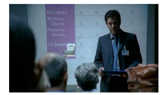
(fig xi, data-reporting session)

personnel accompany Orton on and off the hospital premises after her suspension – another instance, incidentally, of Bodies ' revisionism of mainstream medical drama, where security personnel almost always control unruly patients, not the staff).<sup>xii</sup> But the initial emphasis on first-order mechanisms of control are increasingly displaced by the ethos of the new public management, wherein discipline is internalised, effected by structures of accountability and quality management rather than force. So, for instance, Bodies includes numerous sequences wherein consultants report to peers and management the statistics of recent cases ( fig xi ); management delivers to assembled staff powerpoint presentations of the targets to which they wish them to aspire ( fig xii ); or staff are shown participating in externally-driven quality audits of target-driven performance (for instance, in a dry-run of an audit of meeting time targets for throughput of patients from entry to hospital to treatment and discharge – the management functionary in that sequence times the proceedings with a stopwatch).