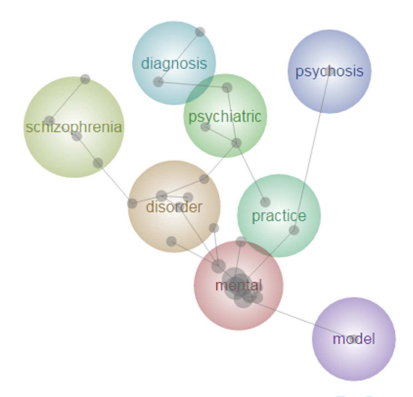
Figure 3 - Concept map of publication titles

Mental is a term related to the mind and this is term can be used in the combination of health or disorder, in the field of psychiatry (see table 9). It is observed from the figure 3 that the journal focusing only on the research comes under the scope of the journal.