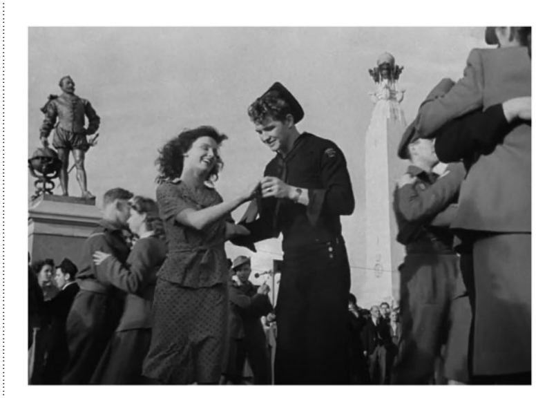
Fig. 5. Dancing on the Plymouth Hoe, in The Way We Live .

63 'Film: "The Way We Live" by Jill Craigie', p. 5; Toby Haggith, '"Castles in the Air": British film and the reconstruction of the built environment, 1939–51' (PhD thesis: University of Warwick, 1998), pp. 169, 177–78.