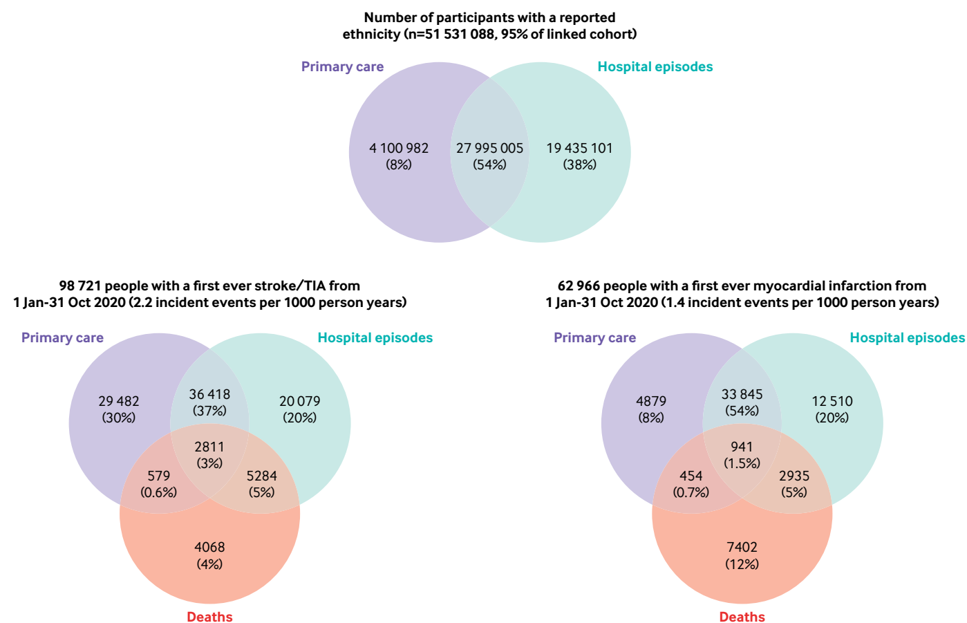
Fig 2 | Data sources reporting person level data on ethnicity, incident stroke or transient ischaemic attack (TIA), and incident myocardial infarction

with covid-19 on the death certificate, 35 the data from our linked cohort concurs with those from relevant cumulative counts of people with covid-19 (supplementary table 8).