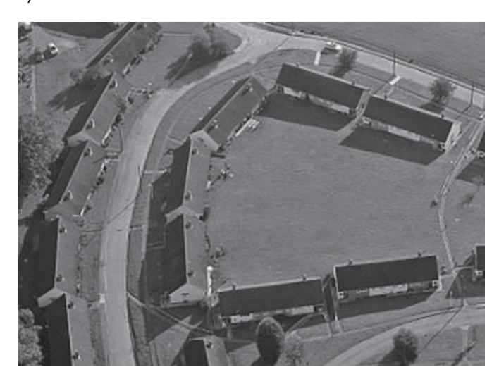
FIGURE 3: Original bungalows.

As Figure 1 also shows, the hilly nature of the site initially dictated how the roads and bungalows were built. The roads followed the contours with very few dead ends or cul-desacs. The 188 one- and two-bedroom (semi-detached) bungalows were ranged in parallel with the roads, had no garages, and were separated from one another by large expanses of shared, communal open space with fences or walls being notable by their absence (Figure 3).