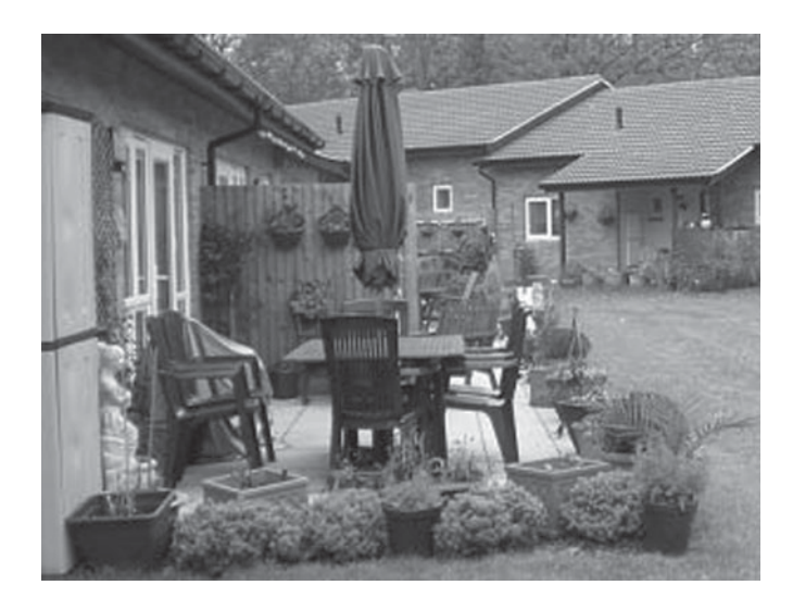
FIGURE 4: New bungalows.

Today, mixed-tenure accommodation and a variety of housing stock have replaced the old rented bungalows and the nursing home. DGV now comprises a mix of leasehold and rented accommodation, ranging from one- and two-bedroom apartments through to bungalows (some with up to three bedrooms) and detached two- and three-bedroom houses. All are designed to Lifetime Homes standards (British Standards Institute 2007) and many of the individual properties have well-defined and fenced-in gardens. Even where this is not permitted (as with the rented bungalows), residents have tended to delineate their territory with trellising, sheds and other physical markers (Figure 4).