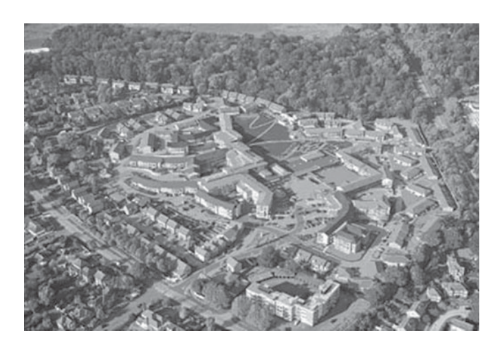
FIGURE 2: Denham Garden Village after redevelopment.