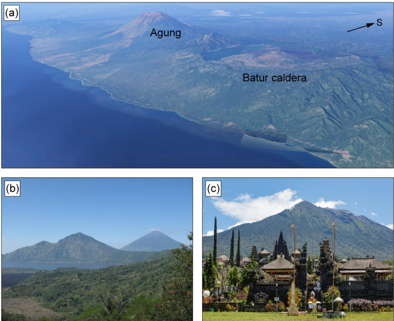
Fig. 2. (a) Oblique view of Gunung (means ‘Mount’ in Indonesian) Agung, the 3,142-m-high stratovolcano in eastern Bali. To the northwest of Agung, the huge caldera of Bali’s other active volcano, Batur, is a reminder of the powerful nature of Indonesian volcanoes (image from Google Earth). (b) Batur caldera with Agung in the background. (c) The Mother Temple of Bali, Pura Besakih, on the southwestern slopes of Agung, which is considered the most important Hindu temple on Bali. Pura Besakih remained largely undamaged by the devastating eruption of Agung in 1963-64 (Photo: CEphoto, Uwe Arana, CC-BY-SA 3.0).