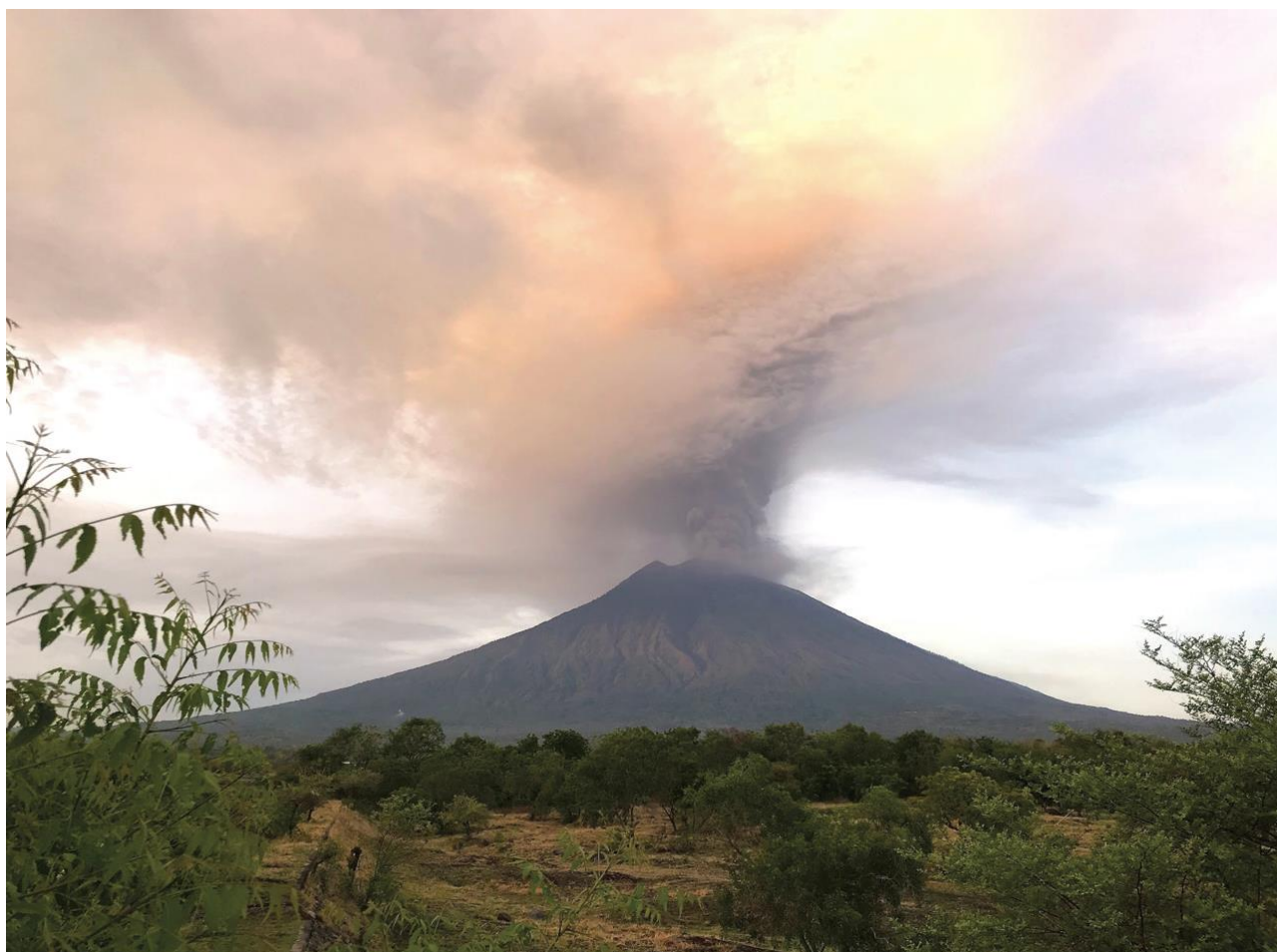
Fig. 1. Forces awakening on the 'Isle of the Gods': Mt Agung, 27 November 2017.