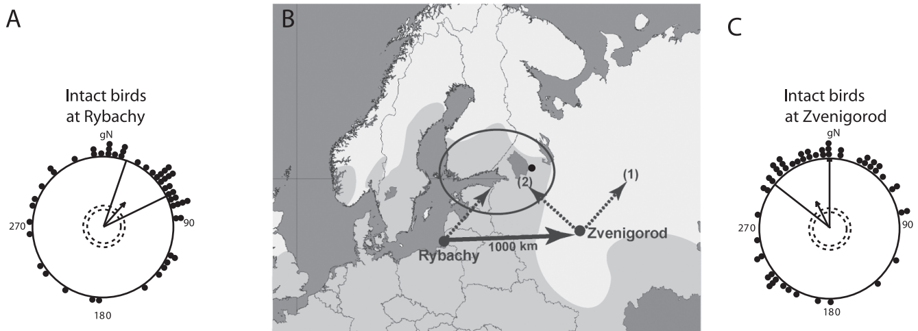
Figure 1. Results of our previous displacement study with intact Eurasian reed warblers (re-drawn after [4]). (A) Orientation of birds at the capture site (Rybachy). (C) Orientation of the same birds after the 1,000 km eastward translocation at the displacement site (Zvenigorod). On A and C, pooled data for 2004, 2005 and 2007 are shown. Each dot at the circular diagram periphery indicates the mean orientation of one individual bird. The arrows show group mean directions and vector lengths. The dashed circles indicate the length of the group mean vector needed for significance (5% and 1% level for inner and outer dashed circle, correspondingly) according to the Rayleigh test [21]. The lines flanking group mean vectors give 95% confidence intervals. gN – geographic North. On (B), a map of the displacement is shown. The shaded light gray zone represents the breeding range of the Eurasian reed warbler. Visual observations by local ornithologists (e.g. [22]) confirm that there are no regular breeding populations of Eurasian reed warblers further east than indicated on the map. The black filled circle represents the single known recovery of a reed warbler ringed in Rybachy and re-captured as a breeding bird [23], [24]. The dashed line vector from the capture site at Rybachy shows the mean migratory direction of the given species according to our previous study ([4], \alpha = 42^\circ ). The solid line circle represents a proposed area where transit Eurasian reed warblers are heading to based on our previous study [4] combined with ringing recoveries (the goal). The solid line vector from Rybachy to Zvenigorod shows the direction and distance of the displacement. The two dashed line vectors from Zvenigorod represent our expectations for V1-sectioned and sham-sectioned birds, respectively: (1): no compensation, (2): compensation towards the eastern part of the breeding range.