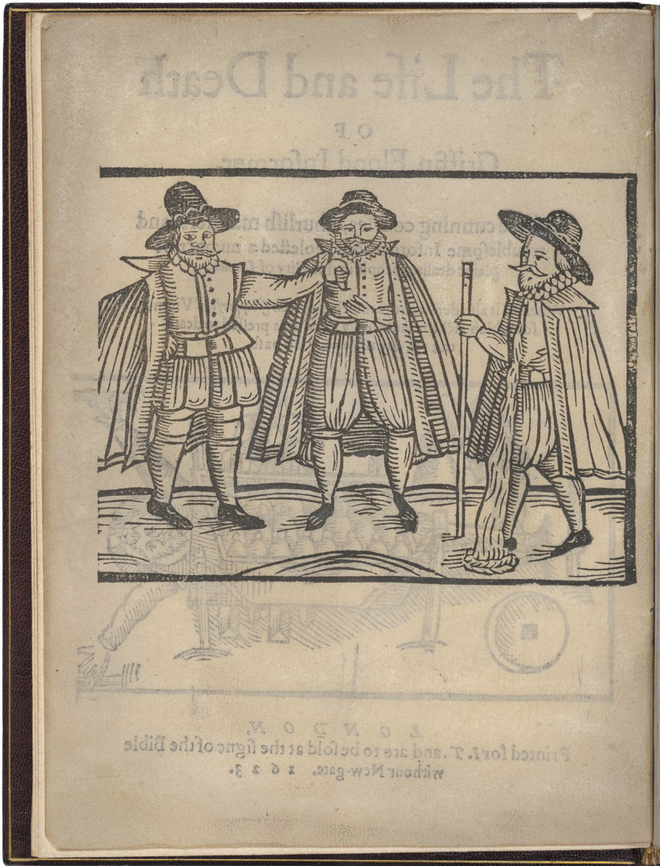
Figure 2. The life and death of Griffin Flood informer. (1623), Folger Shakespeare Library 155966, reproduced with thanks under a CC BY-SA license.

redemption. 110 Early in James I's reign Jeffrey Bownd of Cheshire refused to plead and was therefore pressed. The reader learns that he confessed before two or three