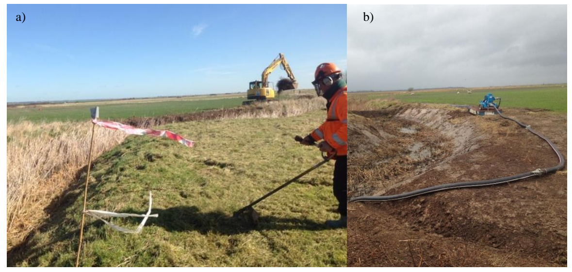
Figure 1: Displacement Area, a) prior to surface scrape and water drawn down, and b) subject to surface scrape and removal of water.

Recapture of water voles: Water voles were live captured using the same pre-displacement method, at all five sites between 18 and 26 April 2017 to investigate the fate of marked individuals and retrieve collars. Additional traps were used to recapture collared individuals whose locations were outside of the study sites.