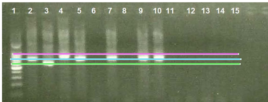
Fig. 3: PCR analysis of biopsy and blood samples from seropositive dogs

1: DNA molecular weight marker (100 bp), 2: Positive control for L. infantum (680 bp), 3: Positive control for L. major , 4: Positive control for L. tropica , 5: Case 2, skin biopsy, 6: Case 2, buffy coat, 7: Case 3, skin biopsy, 8: Case 3, buffy coat, 9: Case 4, skin biopsy, 10: Case 4, buffy coat, 11: Case 5, skin biopsy, 12: Case 5, buffy coat, 13: Case 1, buffy coat, 14: Negative control PCR1, 15: Negative control PCR2, Blue line: L. infantum , Green line: L. major and Pink line: L. tropica