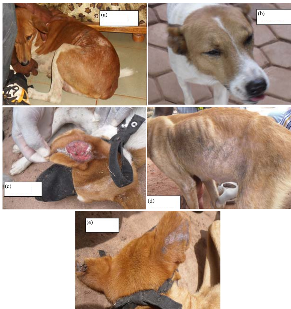
Fig. 2 (a-e): Images of dogs showing different cutaneous lesions and symptoms, (a) Case 1, (b) Case 2, (c) Case 3, (d) Case 4 and (e) Case 5

To confirm the results and to identify the species, PCR analysis was performed on buffy coat samples (all cases) and cutaneous biopsy samples (all cases except Case 1 which did not have open lesions). Biopsy samples were positive for L. infantum in 3 of the seropositive dogs (Case 2, 3 and 4) (Fig. 3). Only one buffy coat sample (Case 3) was positive.